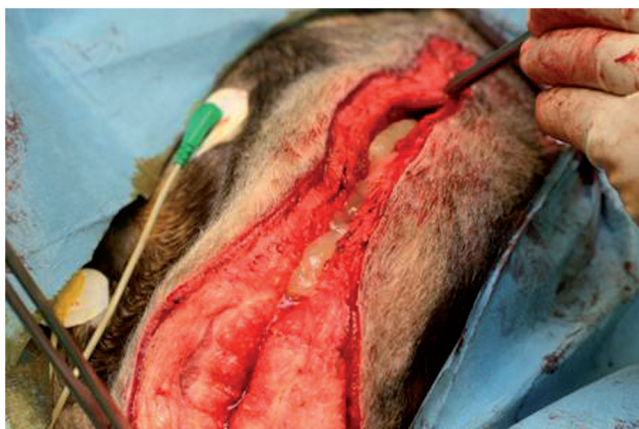
Fig. 1. After closure of median sternotomy, three cylinders of PRGF were applied over the sternal wound, being covered with the subcutaneous and dermal tissue.

of the sheep consisted of cefazolin injected intramuscularly at 1 g/day over five days. Analgesia was guaranteed using metamizol at 2 g intramuscularly every 12 h over five days.